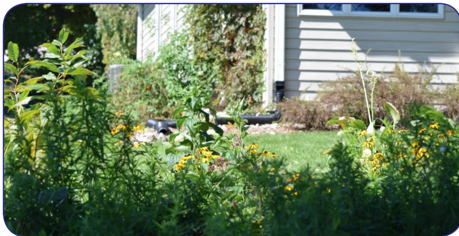
Rock Lake, Jefferson County - Pamela Toshner

A RAIN GARDEN , an upland best practice, is a landscaped shallow depression with loose soil and native plants designed to collect roof, path, and driveway runoff while also creating wildlife habitat and natural beauty.