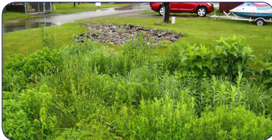
Shell Lake, Washburn County - Brent Edlin

A RAIN GARDEN , an upland best practice, is a landscaped shallow depression with loose soil and native plants designed to collect roof, path, and driveway runoff while also creating wildlife habitat and natural beauty.